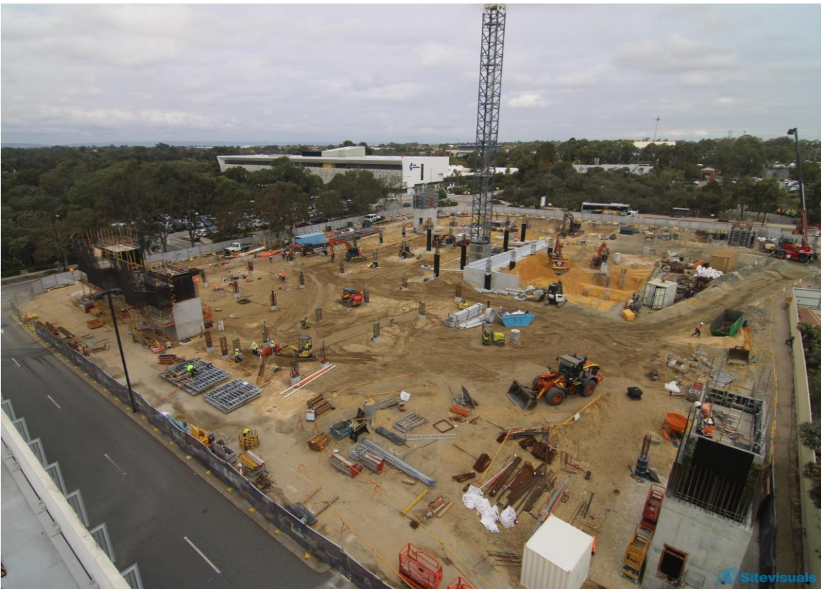
Aerial picture of the new car park site

Installation of inground services for the building has also commenced, and wall and column construction is advancing across the site.