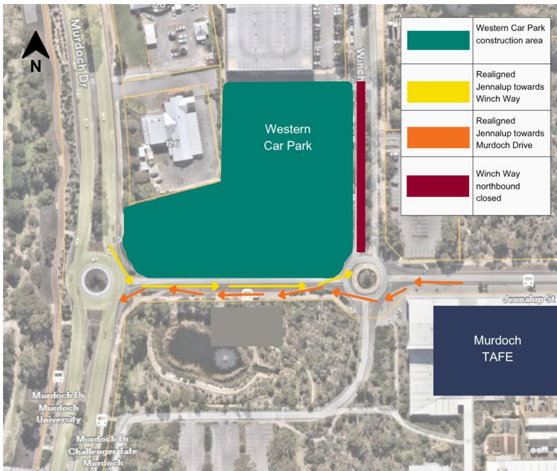
Modified traffic arrangements at Jennalup Street from mid-to late June

These traffic arrangements are expected to remain in place until mid-2027.