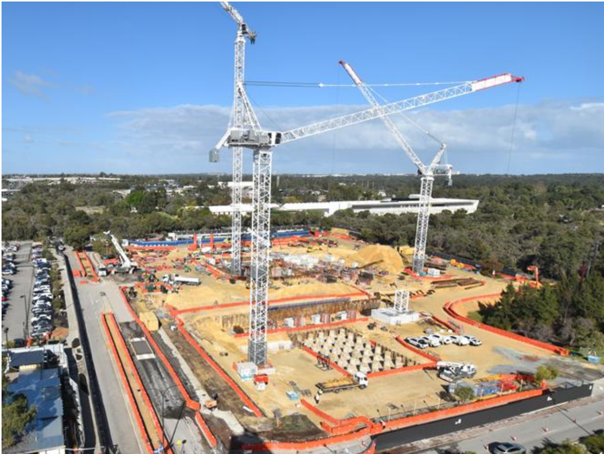
Aerial picture of Women and Babies Hospital site

Construction is progressing on the new Women and Babies Hospital and first multi-deck car park, both located within the Fiona Stanley Hospital precinct in Murdoch.